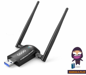
QG00 A23 Dual Antenna USB WiFi Adapter